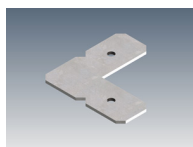
JN-90 90 degree joiner