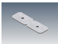
JN-ST Straight joiner