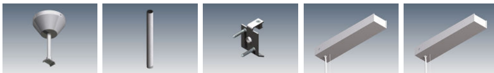
SRK-10-S (silver) SRK-10-W (white) SRK-10-B (black) Rod suspension kit (rod not incl.)